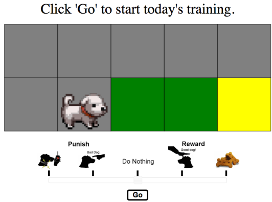
Fig. 1. The training interface shown to AMT users.

The issues with interpreting feedback as reward have led to the insight that human feedback is better interpreted as a comment on the agent’s behavior; for example, positive feedback roughly corresponds to “that was good” and negative feedback roughly corresponds to “that was bad.” Existing HCRL work adopting this perspective includes TAMER [1], SABL [6], and Policy Shaping [5], discussed in more detail in the Related Work section. We note, though, that all assume that human feedback is independent of the agent’s current policy.